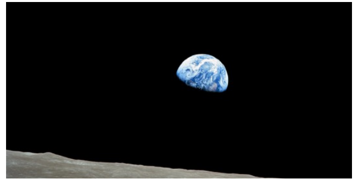
Sky Event Almanacs